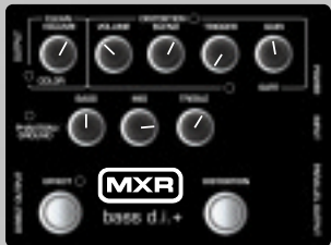
TWIGGY RAMIREZ / MARILYN MANSON