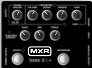
ROBERT TRUJILLO / OZZY OSBOURNE IN-LINE SETTINGS